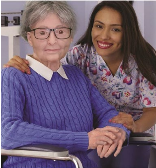
LNA with TERi™ geriatric manikin

With workforce shortages continuing to challenge just about every business in the region, VNHCH is looking for new and innovative ways to build its own source for recruitment by investing in technology to train new LNAs.